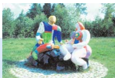
On the art trail at the university: Adam & Eve by Niki de St. Phalle

whose exhibits range from the Old Stone Age to the early Middle Ages. The Edwin Scharff Museum showcases sculptures, paintings and graphic works by the artist. The Donauschwaben Museum illustrates the colourful history of the "Danube Germans", German settlers in the Danube region, from the 18th century to today.