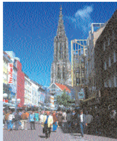
Shopping in Hirschstrasse

Ulm Minster has the tallest church steeple in the world. The "lion man" in Ulm Museum, thought to be around 35,000 years old, is the world's oldest human-animal sculpture and the Fisherman's Quarter ( Fischer-viertel ) has what is claimed to be the world's most crooked hotel. But Ulm/Neu-Ulm is not just about such superlatives: the 'Serenade of Lights' (Saturday before Oath Monday), the many sporting events of (inter-)national importance and, from spring 2007, the new Weishaupt Art Gallery also put Ulm on the map. In 2006, the World Cup will be live and in glorious Technicolor on the video wall in Ulm's Münsterplatz.